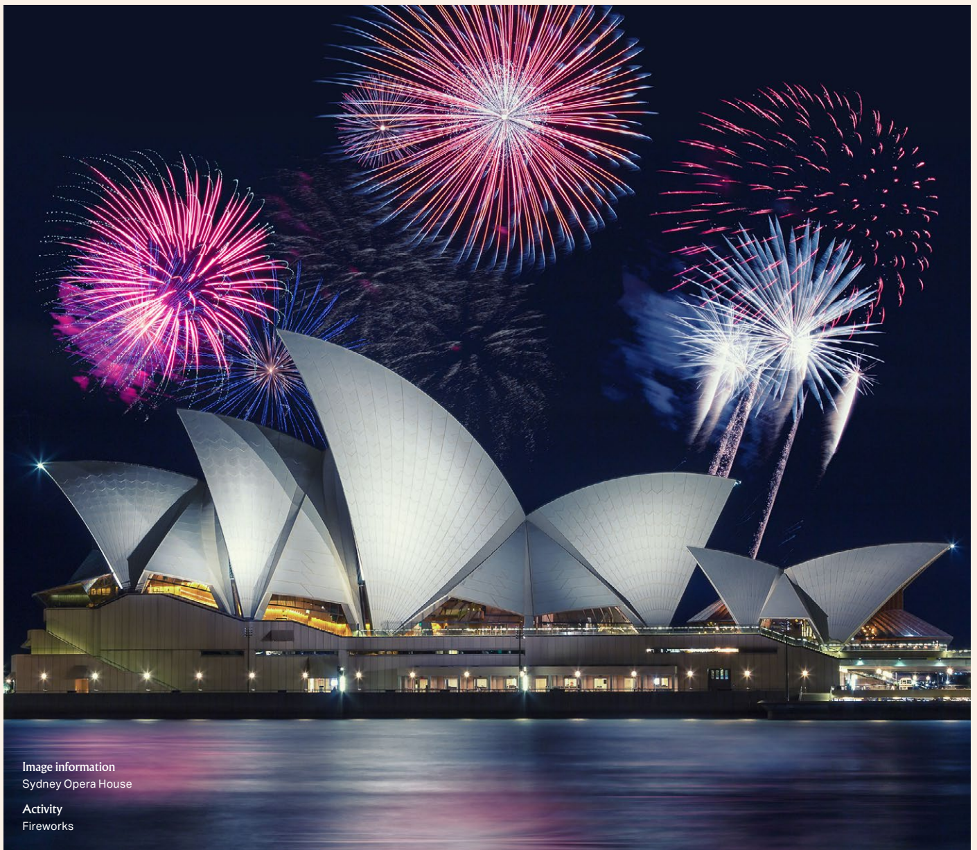
Image information Sydney Opera House Activity Fireworks