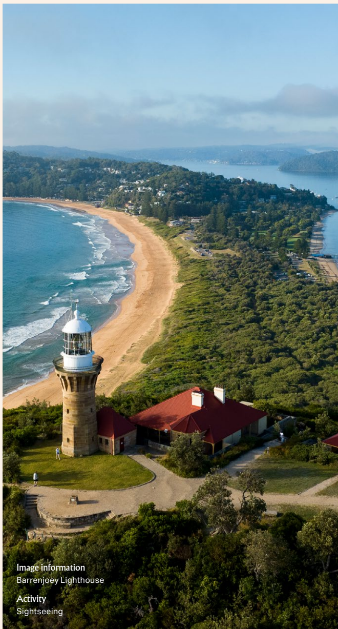
Image information Barrenjoey Lighthouse Activity Sightseeing