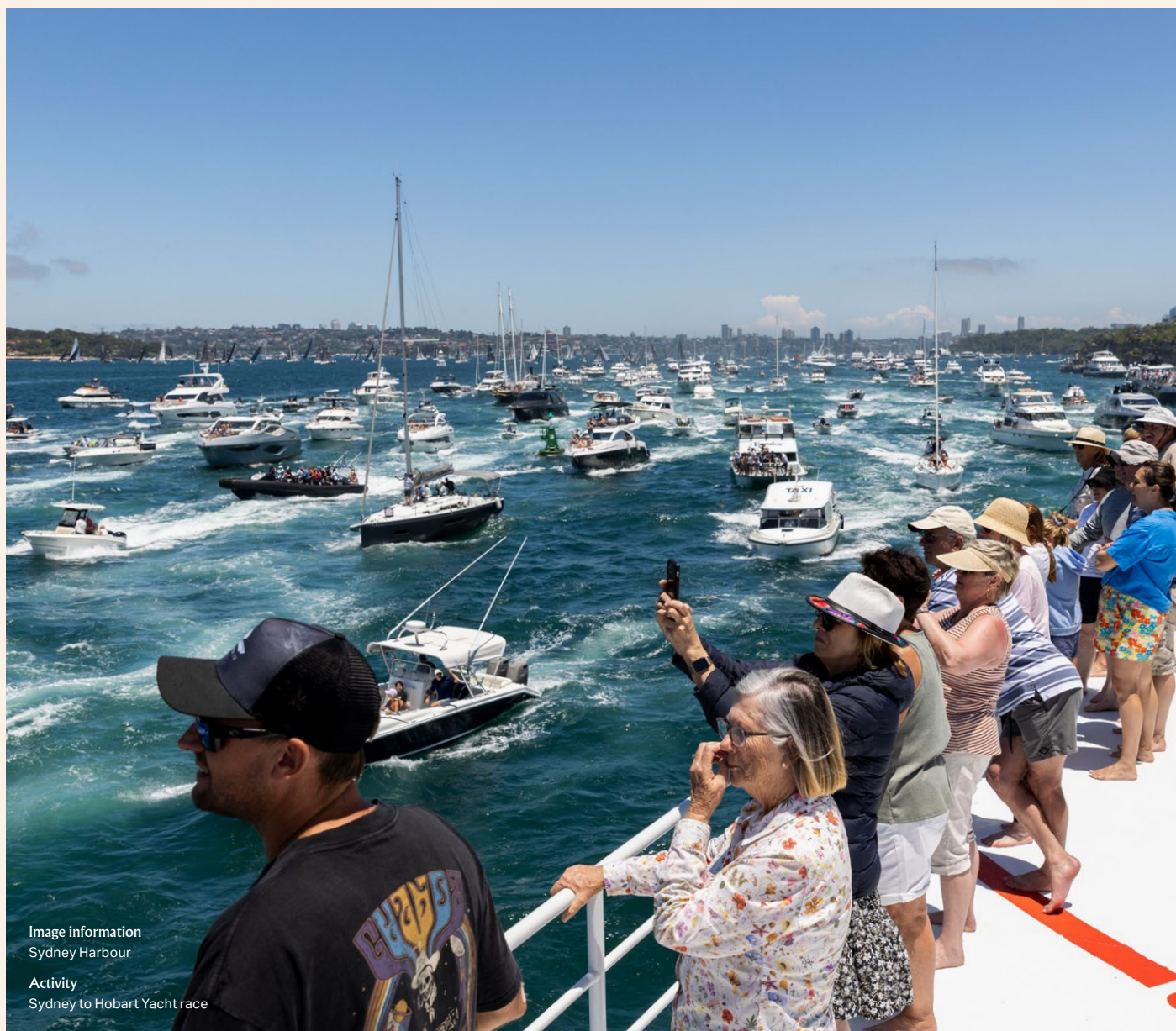
Image information Sydney Harbour